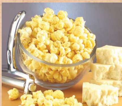
F855 • White Cheddar

Our secret blend of gourmet cheeses provides the most delicious cheesy cheddar corn ever!