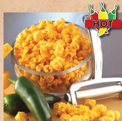
F853 • Cheddar Jalapeño

Toasty popcorn complements the creaminess of butter.