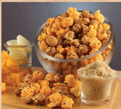
F854 • Chicago Style