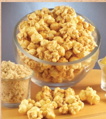
F850 • Buttery Caramel

A combination of our delicious gourmet buttery caramel corn and our cheesy cheddar corn makes this the perfect snack!