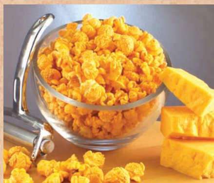
F851 • Cheesy Cheddar

Cheddar cheese combined with jalapeño for right amount of heat!