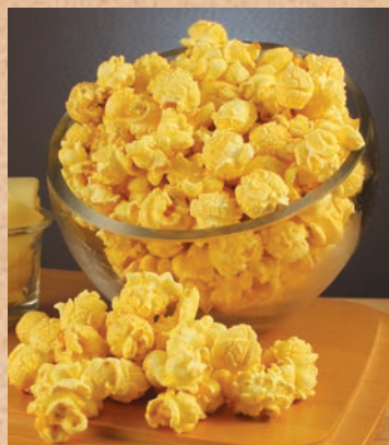
F865 • Movie Theater Butter

A rich and buttery classic that is a favorite of many!